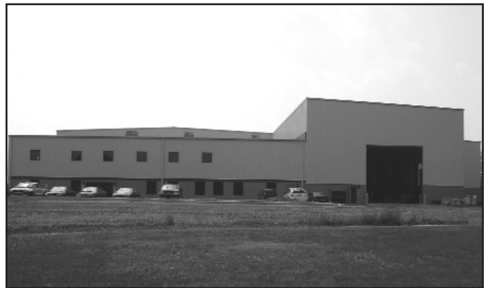
MODERN'S NEW EASTON PLANT

3900 Glover Rd. Easton, PA 18040 Office: (484) 548-6200 Fax: (610) 258-8165 www.modcon.com