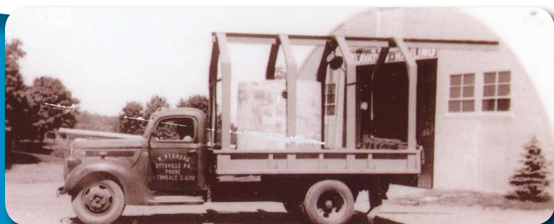
Modern's First Tank Truck was a 1939 Ford — purchased in 1952.